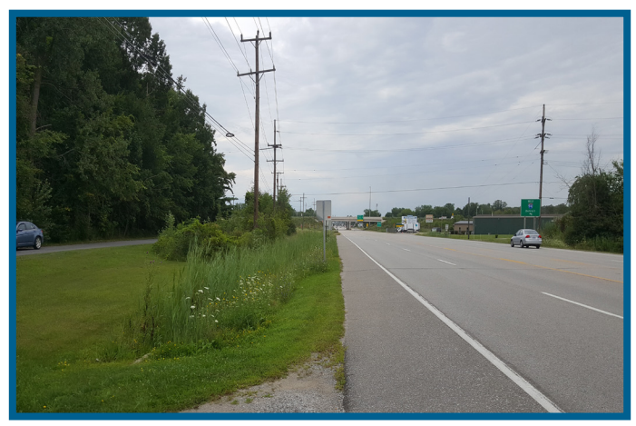
Gratiot Road north shoulder, west of I-94.

Last summer, SEMCOG awarded a $159,500.00 Transportation Enhancement Program (TAP) grant to St. Clair County to construct a paved trail along the north side of Gratiot Road in Kimball Township from the I-94 Park N Ride, under I-94 to Pickford Road. This fall, Project Control Engineering of Clay Township developed construction plans and specifications for the trail. Construction of the trail is expected to start in the summer of 2018. The project is the first phase of a plan to connect the Bridge to Bay Trail to the Macomb Orchard Trail in Richmond. In turn, the trail will be part of the Great Lake to Lake Trail running from the City of Port Huron to the City of South Haven.